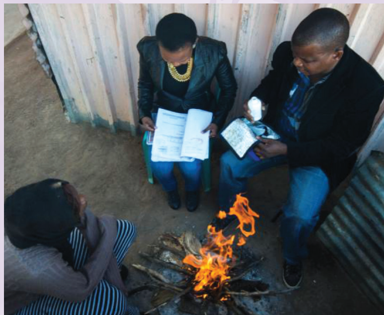
Figure 6: In-reach team on a home visit.

With short-term emergency funding from the National AIDS Coordinating Agency (NACA), we were able to continue outreach services to 16 sites from July 2013 to April 2014. During these monthly visits, the outreach team saw a total of 1,875 patients, 879 of whom were failing treatment. Altogether, 215 health professionals were mentored.