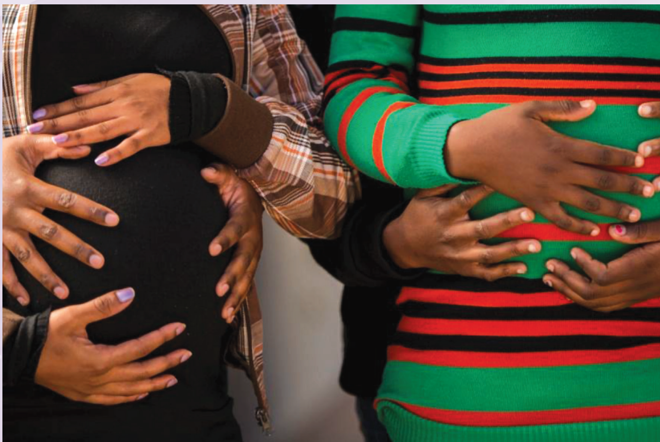
Figures 7: Teen mothers receive encouragement and skill training at the Teen Mothers support group.

This year, the teen mothers have been learning about financial literacy and job readiness, in order to provide them with greater tools to sustain and provide for their new families. From January to June, an NGO called Kagisanong Women's Shelter facilitated a seven-session gender and gender-based violence workshop to the teen mothers. The workshop covered gender and sex, gender norms in Botswana, power imbalances and their connection to gender-based violence.