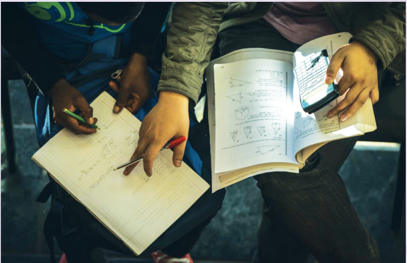
Figure 10: A client receives help on geometry homework during a weekend tutor session.