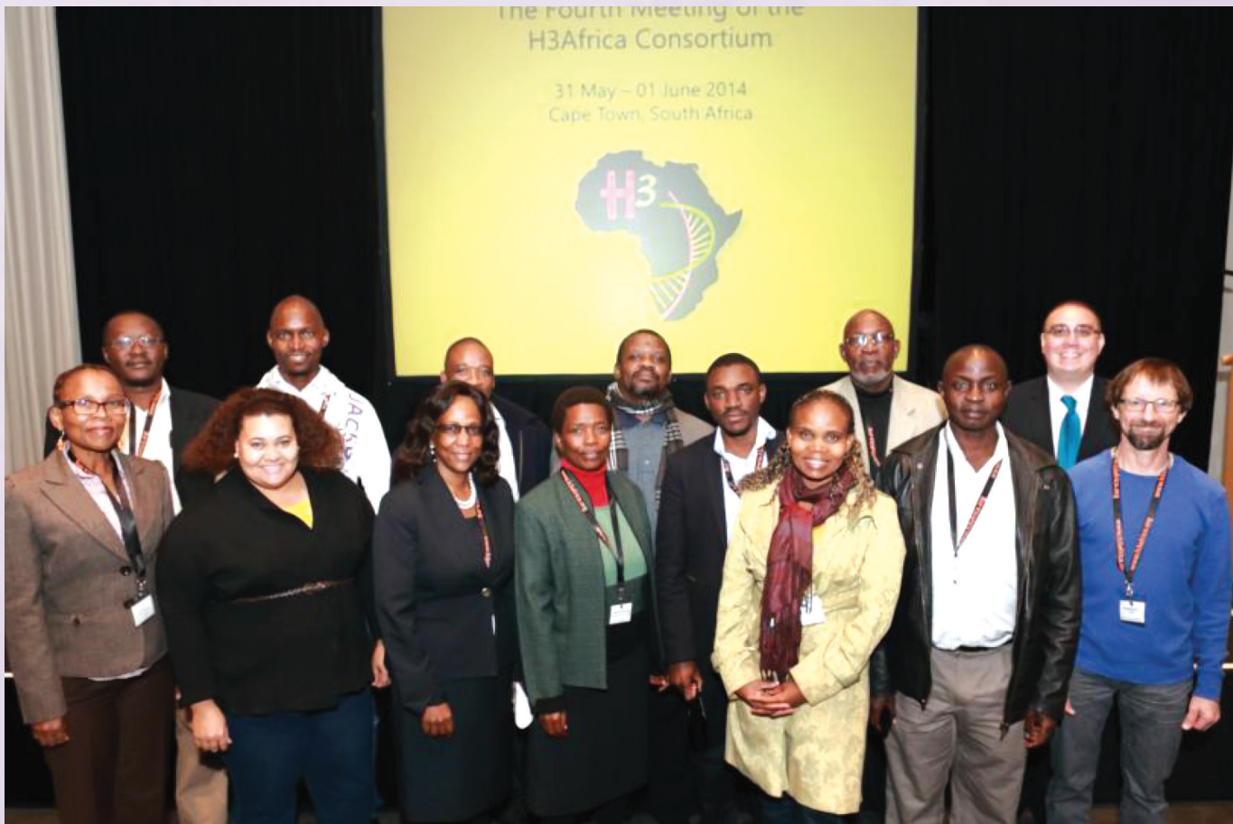
Figure 12: The CAfGEN research team at the Fourth H3Africa Consortium meeting in Cape Town in May 2014.