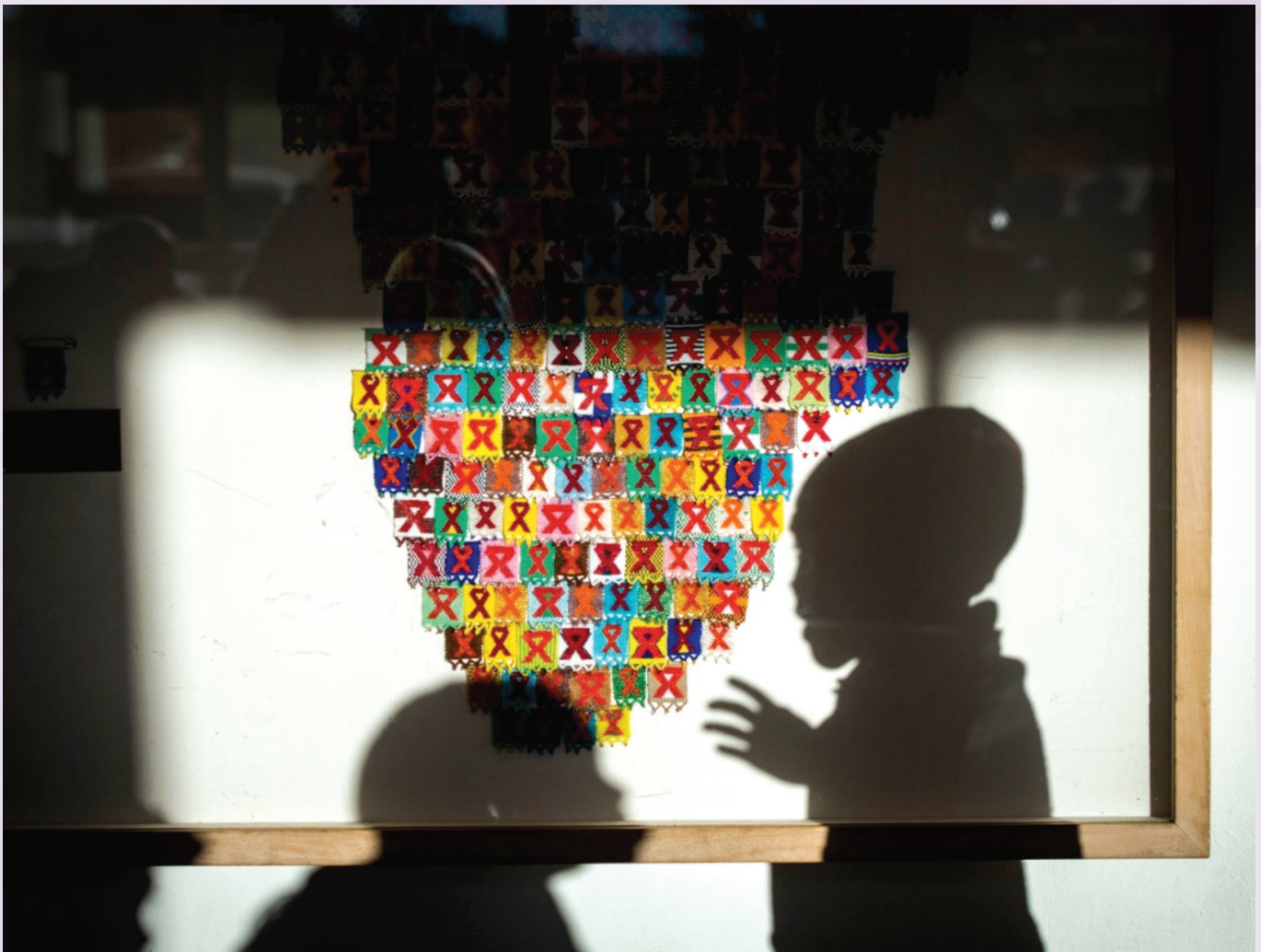
Figure 2: Patients waiting for their appointments at the COE

BIPAI Mission: To provide high quality, high impact, highly ethical paediatric and family-centered health care, health professional training, and clinical research, focused on HIV/AIDS, tuberculosis, malaria, malnutrition and other conditions impacting the health and well-being of children and their families worldwide.