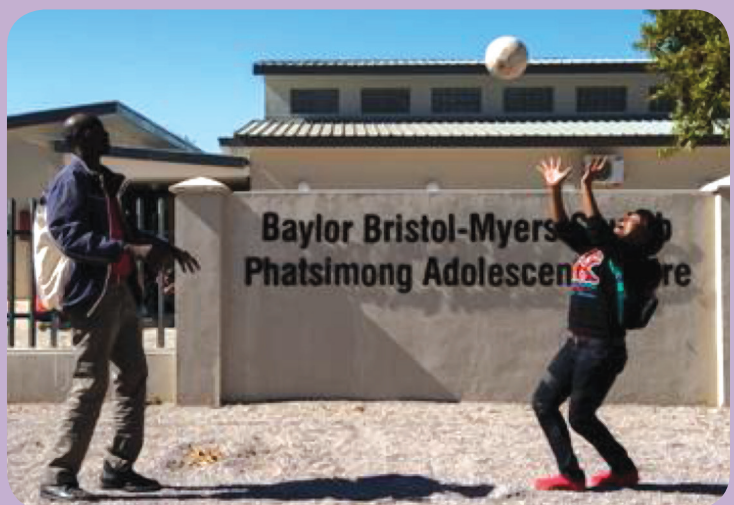
Figures 9-11: Teens gather at the Baylor Bristol-Myers Squibb Phatsimong Adolescent Centre