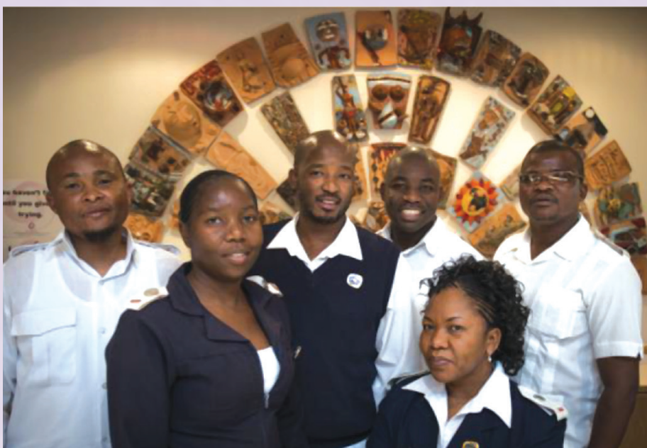
Figure 4: COE Nurses during the World's Nurses Day

Nurse prescribers have been the backbone of the clinic since the inception of the nurse prescriber programme five years ago. The programme has compensated for the shortage of doctors in the clinic. We currently have 9 nurses trained in the provision of paediatric HIV/AIDS screening, care and treatment. These nurses see more than half of our stable patients, and patient satisfaction remains high.