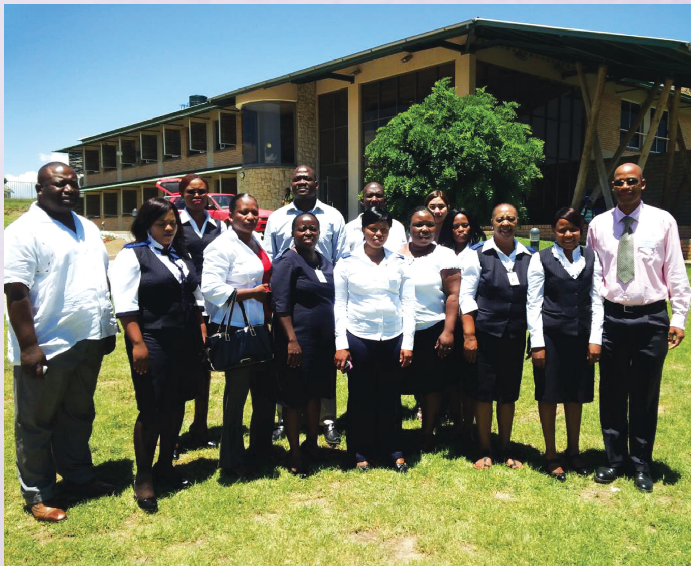
Figure 5: Baylor Lesotho Health Care workers following sputum induction training by Botswana-Baylor team in Maseru, Lesotho.

Unfortunately, this project will come to an end this year with end of PEPFAR support. The Botswana-Baylor COE is working hard to secure new funding and partnerships to continue and expand this important project.