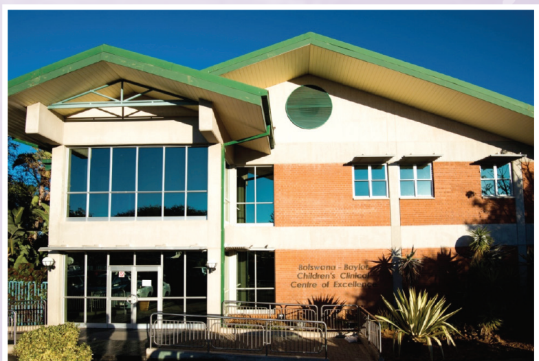
Figure 1: The Botswana-Baylor Children's Clinical Centre of Excellence in Gaborone

'In appreciation and gratitude to the Bristol Myers Squibb employees who generously donated to make this Centre a reality'