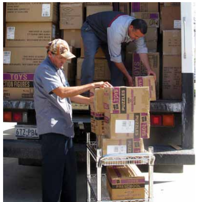
Boxes of toys donated by Houston Children's Charity are unloaded at the Vannie Cook Children's Clinic.

By holding Christmas toy distributions and other events, Houston Children's Charity helps disadvantaged children expand their awareness and experience some of the joys of life.