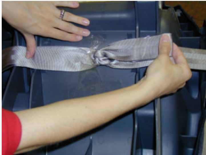
tie and tape to bottom of seat