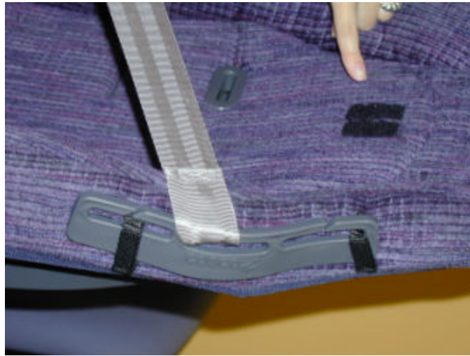
Webbing looped at comfort guide; Velcro on back of seat to hold Alex's head