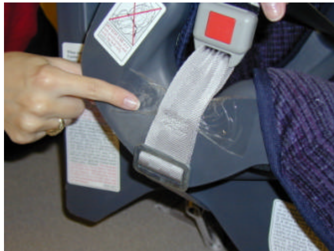
Buckle (taped through loop)