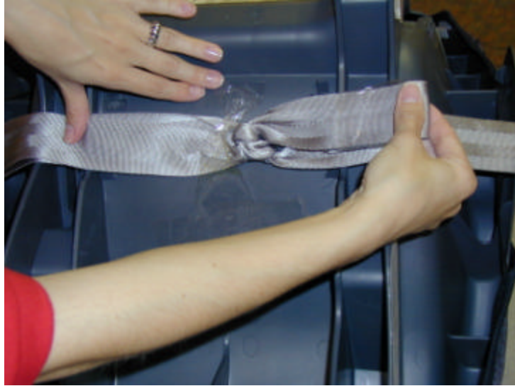
tie and tape to bottom of seat