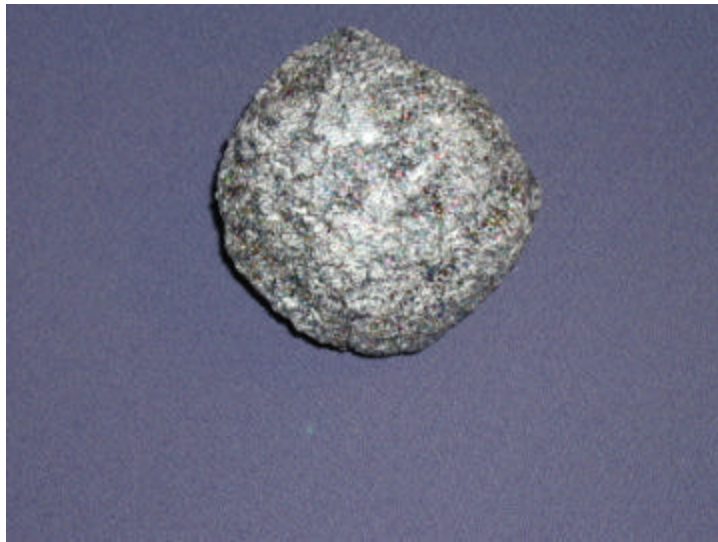
Soft Ball size Moon Rock (paper mache, glitter paint)